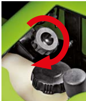
Details of the adjustment

The blades are automatically disengaged once the grass catcher is full; the cutting process will be stopped. There is also the possibility to choose the "buzzer indicating" option that signals that the catcher is full.